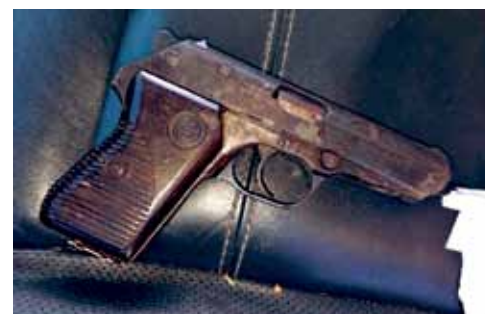
A firearm that was found in possession of the suspects during attempted armed robbery at Leeuwfontein.