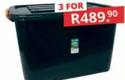
85lt STORAGE BOX WITH LOCK LID & WHEELS sc71677